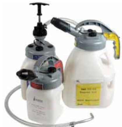
Figure 2 | Clean-handling tools are very important to maintain lubricant effectiveness.